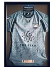
Sydney Football Club Jersey Signed by 2024 Current Players

Donated by Luxway Australia Pty Ltd Valued at $310