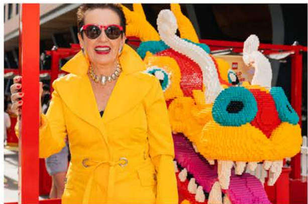
Clover Moore AO Lord Mayor of Sydney