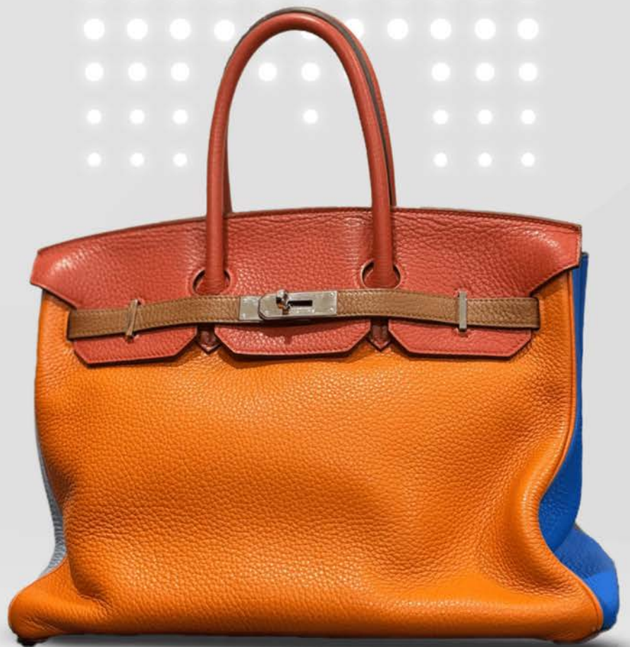
HERMÈS BIRKIN MULTI-COLOUR TOTE BAG