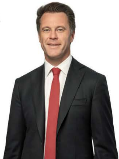
Chris Minns MP Premier

A handwritten signature in black ink that reads "Chris".