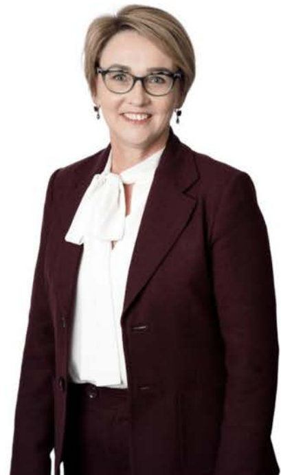
The Hon. Jodie Harrison MP Minister for Women

I wish you a wonderful evening and look forward to your ongoing contributions - making NSW a more inclusive and prosperous place for everyone.