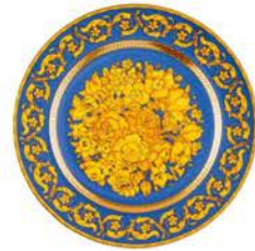
Versace X Rosenthal Floralia Blue Wall Plate 30cm