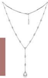
Ellie Sterling Silver Necklace IOMM South Sea Pearl with White Sapphires