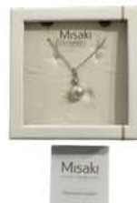
Misaki Pearl Necklace No. 1 & No. 2

Donated by Luxway Australia Pty Ltd Valued at $310