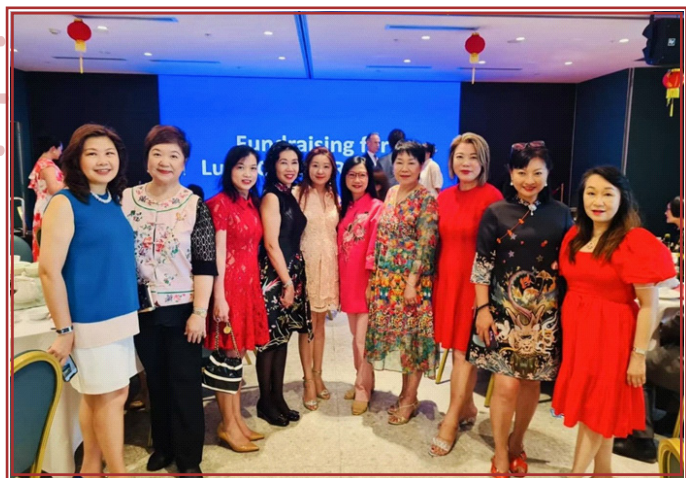
Rotary Club of Chatswood 為癌症基金籌款活動