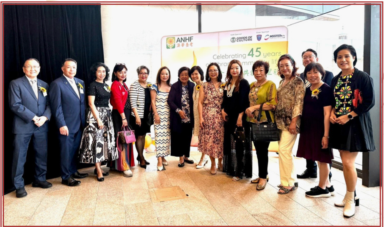
澳華養老45周年《得寵先生》慈善放映會