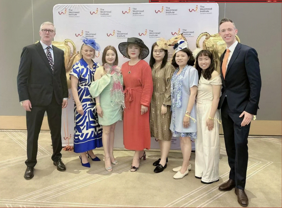
The Westmead Institute 春季慈善馬會籌款活動